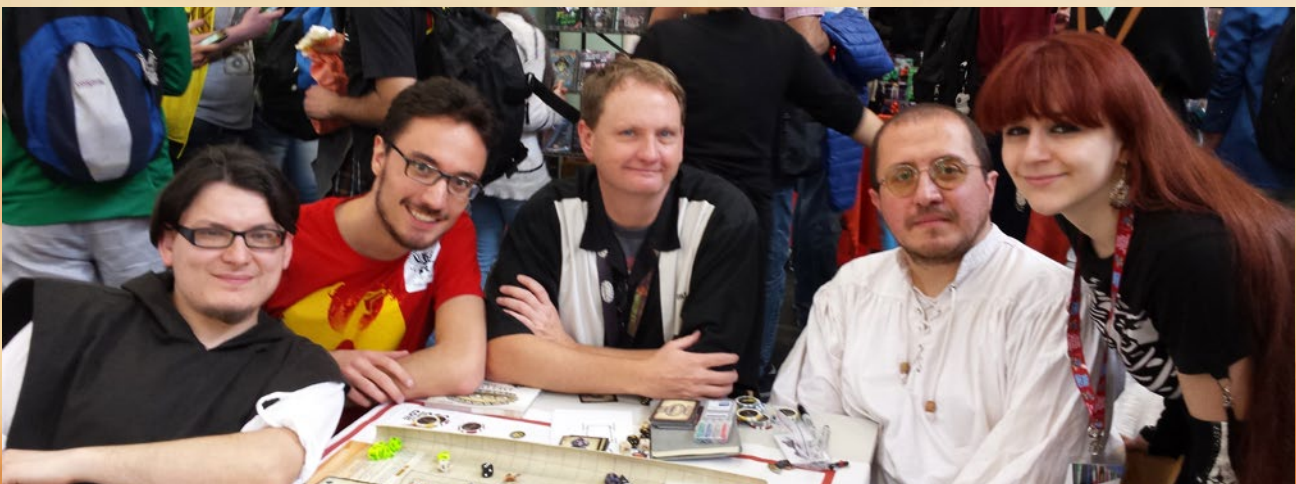
An Italian posse during my trip with our partners at Jolly Troll.